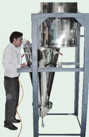
Air blow cleaning.