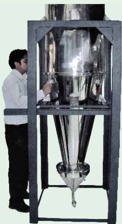
Slide, reclamp & ready to go....