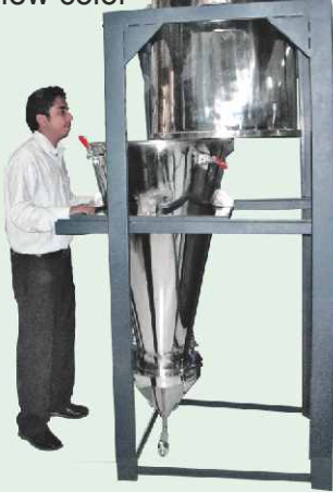
Unclamp and slide.

1, 2, 3 and you are ready for a new color